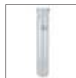
A00001088 Test tube 300 ml Ø 48x260 mm