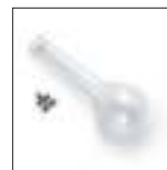
A00000285 Alcoholic strength kit