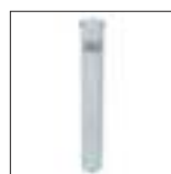
A00001080 Test tube Ø 42x300 mm