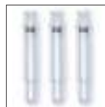
A00000185 Test tube 400 ml Ø 50x300 mm