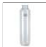
A00001083 Test tube 1000ml Ø 80x300 mm