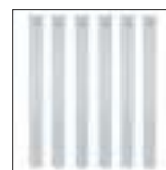
A00000146 Test tube 100 ml Ø 26x300 mm