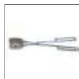
10000247 Princer for test tubes

Inlet tube, discharge tube and protective film for touch screen are supplied with the instrument