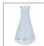
10001106 Collecting flask 250 ml