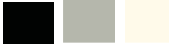
Black E0-09 Silver Grey E0-02 Silver Grey E0-00