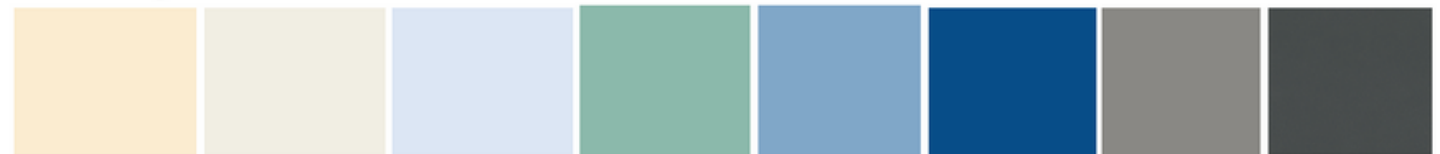
Sand E3-01 Pastel Grey E0-015 Icy Blue E25-01 Aquamarine E20-12 Powder Blue E17-32 Deep Blue E17-82 Mid Grey E0-04 Slate Grey E0-07